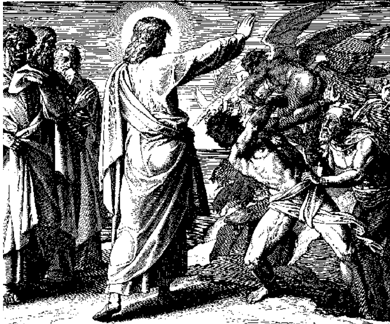
Jesus Drives Out Demons