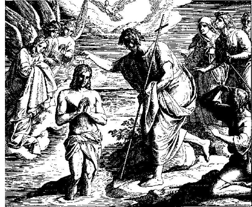
The Baptism of Our Lord