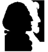
The President's Corner

The Church Council and I thank you for your continued prayers and support. We thank God daily for all the blessings he showers on us.