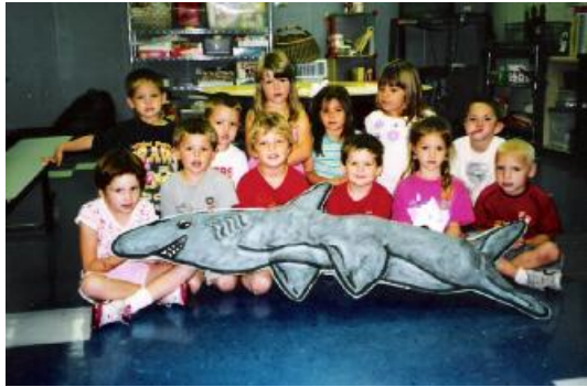
Four year olds with their giant shark they made together.