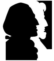
The President's Corner