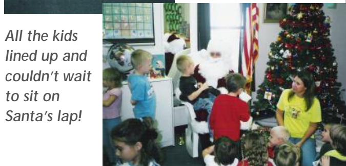
All the kids lined up and couldn't wait to sit on Santa's lap!