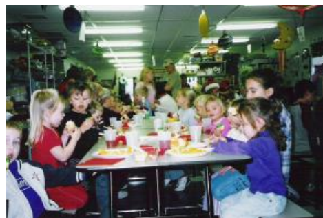
Child Care parents and children enjoying lunch at our annual Christmas party!