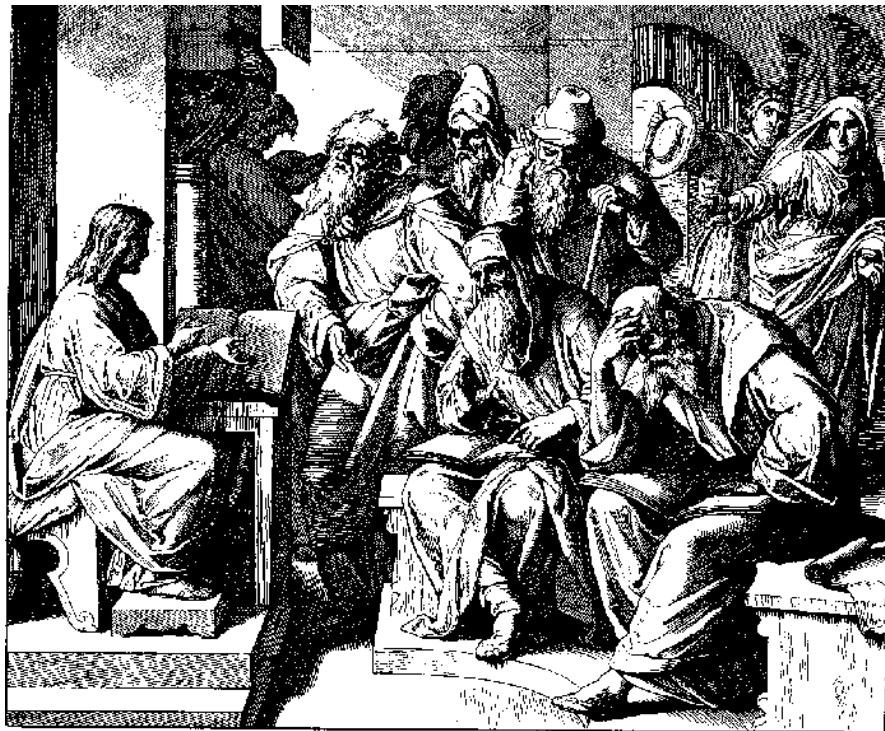
Boy Jesus in the Temple