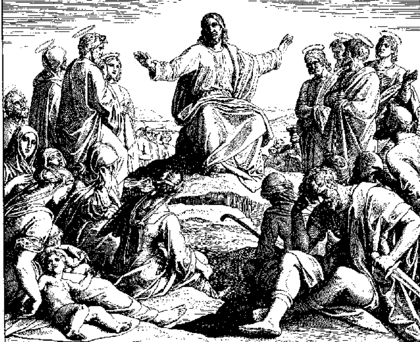
Sermon on the Mount