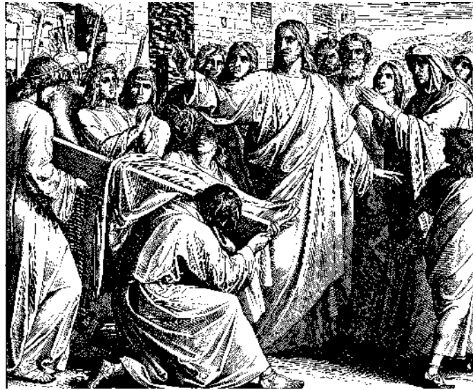
Jesus Raises the Widow’s Son

VACATION BIBLE SCHOOL: Volunteers are needed to help with this year’s VBS program. Please contact Wendy Horvath if you are available. VBS runs the week of July 26 th through July 30 th .