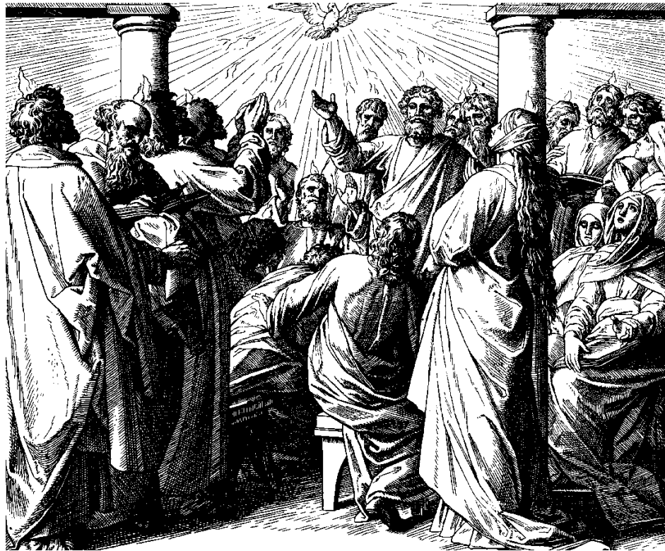
The First Pentecost