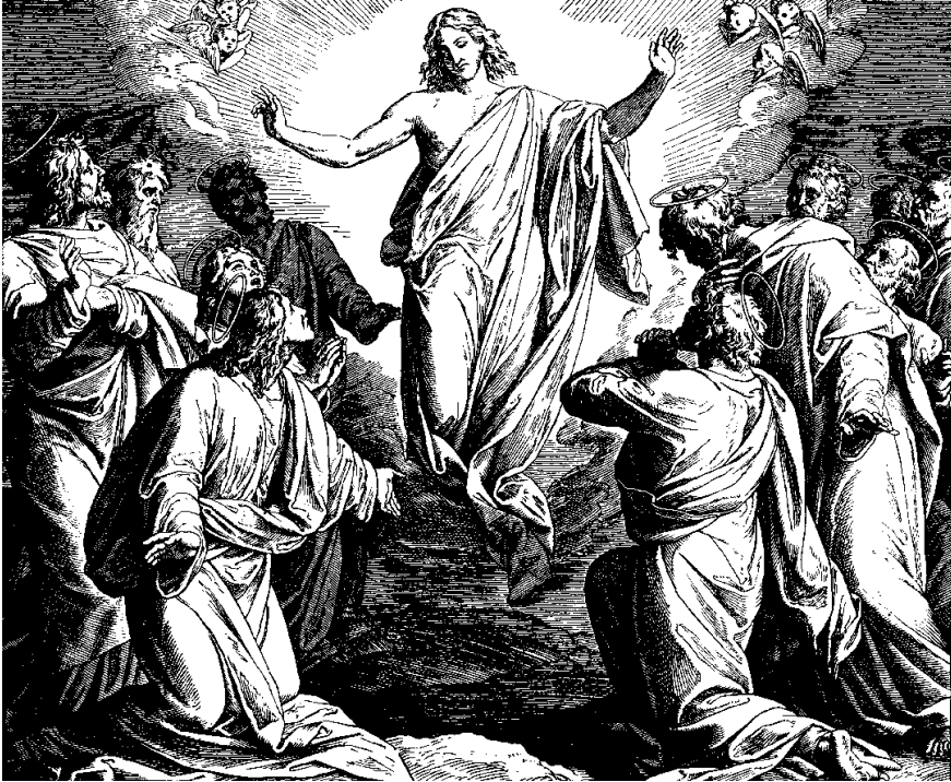
The Ascension of Our Lord Thursday, May 13 th