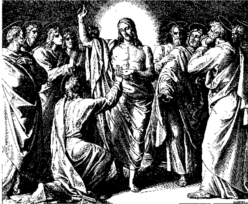
Jesus Appears to Thomas

your Twitter account! Any questions about Twitter, setting up an account, etc, please contact the office. Give Pastor a tweet!