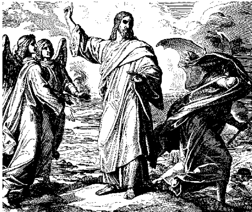
Satan Tempts Jesus