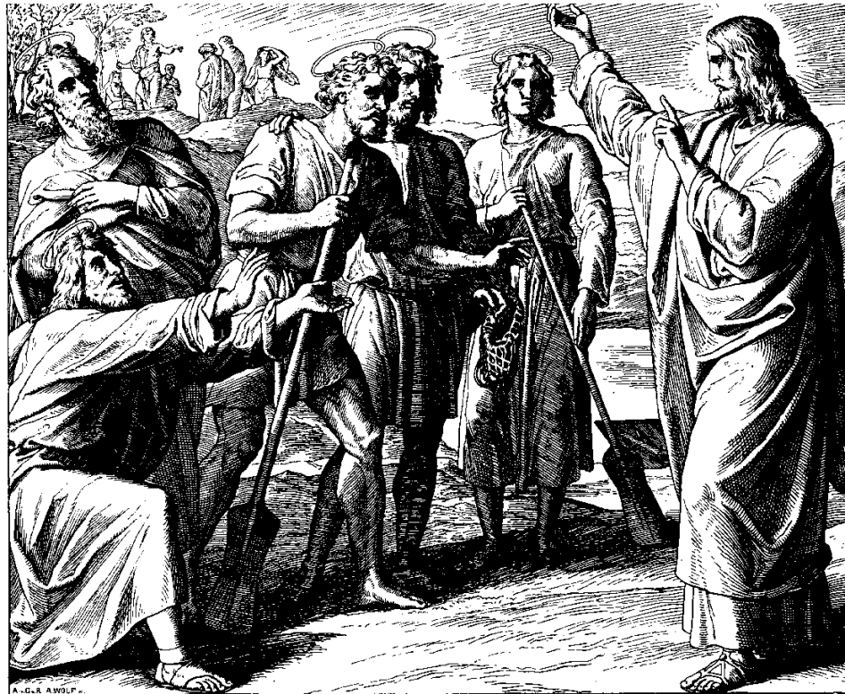
Jesus Calls His Disciples